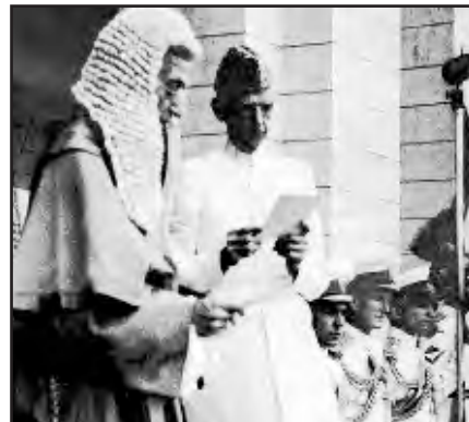
Quaid-e-Azam (R.A) taking oath as 1st Governor General of Pakistan

On August 13, 1947 Viceroy Lord Mountbatten came to Karachi. On August 14, 1947 both Quaid-e-Azam (R.A) and Mountbatten reached constituent Assembly Hall and Viceroy officially transferred the power of the newly born state of Pakistan.