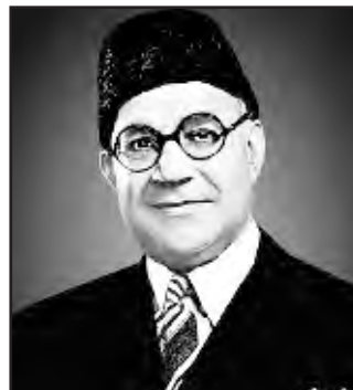
Liaquat Ali Khan

The Finance Ministry was given to Liaquat Ali Khan with the intention that he had no experience of finance, therefore, he could not run the ministry successfully, thus there would be the chance to blame Muslim League. But Liaquat Ali Khan proved a successful finance minister. He prepared the budget in such a way that would be beneficial for poor and harmful for Hindu capitalists. The Hindu capitalists were the main supporters of the Congress. After the implementation of the Budget, they turned against Congress. Therefore, Hindus began to oppose the budget which spoiled the environment.