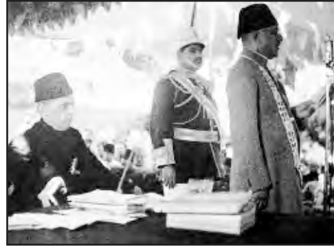
Quaid-e-Azam (R.A) presiding over session

In the words of Quaid-e-Azam (R.A), "Hindus and the Muslims belong to two different religions, philosophies, social customs and literature. They neither intermarry nor inter-dine and indeed they belong to two different civilizations which are based mainly on conflicting ideas and conceptions. Their concepts on life are different. It is quite clear that Hindus and Muslims derive their inspiration from different sources of history. To yoke together two such nations under a single state, one as a numerical minority and the other as a majority, must lead to growing discontent and final destruction of any fabric that may be so built for the government of such a state."