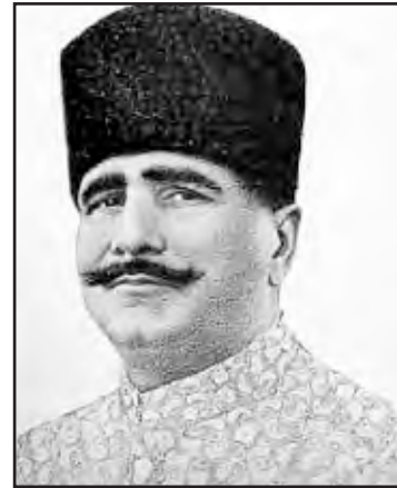
Allama Muhammad Iqbal (R.A)

When in December 1930 most of the Indian leaders were busy in Round Table Conference in London to discuss future course of action, Muslim League convened its meetings at Allahabad. Allama Iqbal presided over the annual session. His presidential address carries great importance in political history of subcontinent. Allama Iqbal (R.A) highlighted the Two-nation theory and argued that subcontinent was a homeland of two nations and Muslims are a separate nation in this country. Islam is a complete code of life which offers comprehensive guidance for socio-political and cultural issues. Hence, Muslims can never forego their religion. If Hindus were demanding independence from British, Muslims were also justified in getting separated from Hindus to preserve their distinct existence. Under the circumstances, the only possible solution for constitutional problem of India would be to separate majority areas of Muslims into a homeland.