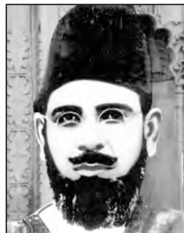
Maulana Muhammad Ali Jauhar

When the leaders of Khilafat Movement announced to launch a Non-Cooperation