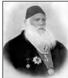
Sir Syed Ahmad Khan

Sir Syed Ahmad Khan was born on October 17, 1817 at Delhi in a noble family. He wanted that Muslims should educate themselves with Western education to regain their lost prestige and status. He loved his nation very much. He could not see the bad condition of Muslims. Sir Syed Ahmad Khan believed that Muslims could not be able to remove British from power. Therefore, the Muslims should reconcile with the British and should educate themselves. He believed in the trinity of ideas (i) loyalty to British, (ii) devotion to education and (iii) aloofness from politics. In this way, he showed the Muslims the path of progress.