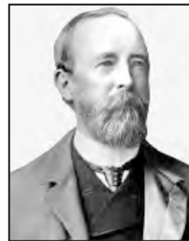
Allan Octavian Hume

Mr. Allan Octavian Hume, a retired British civil servant formed Indian National Congress. When Hume was in service, he thought that increasing political unrest, economic difficulties of the masses and increasing conspiracies might create the situation like that of war of independence of 1857. Therefore, he thought that there was a need of an organization through which they might express their grievances. Therefore, he established Indian