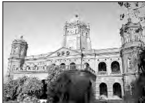
General post-office, Lahore

The postal department was organized on modern lines as the British government was in need of efficient postage system to send orders throughout the country. New post-offices were opened and trained people were appointed. In 1887, General Post Office (GPO) was established in Lahore. A close coordination was developed among different departments for the success of this system. The British Government also improved the telegraph system. The British government had established the communication system for its own benefit, however, the people of sub-continent also got benefit from it. The increased interaction and exchange of things among the people resulted in trade development. The postal and telecommunication systems had positive effects on the people.