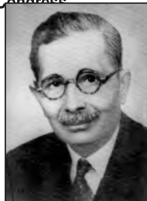
Ch. Khaliq Uzzaman

Ch. Khaliq Uzzaman was President of Muslims League of U.P and Muslim League won 27 seats in the elections of this province. Ch. Khaliq Uzzaman negotiated with leadership of congress to include Muslim League in government but the President of Congress put some conditions which were not acceptable to the Muslim League. Actually it was a plan to eliminate Muslim League from the Province by inducting its members in the cabinet in individual capacity but the leaders of Muslim League refused to accept them.