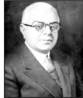
Sir Agha Khan

reforms were meant to increase Hindus influence and downgrade the Muslims position. Therefore, a deputation of prominent Muslims led by Sir Agha Khan met Viceroy Lord Minto on 1 st October, 1906 at Simla. In the history, it is known as Simla Deputation. The delegation made the following demands: