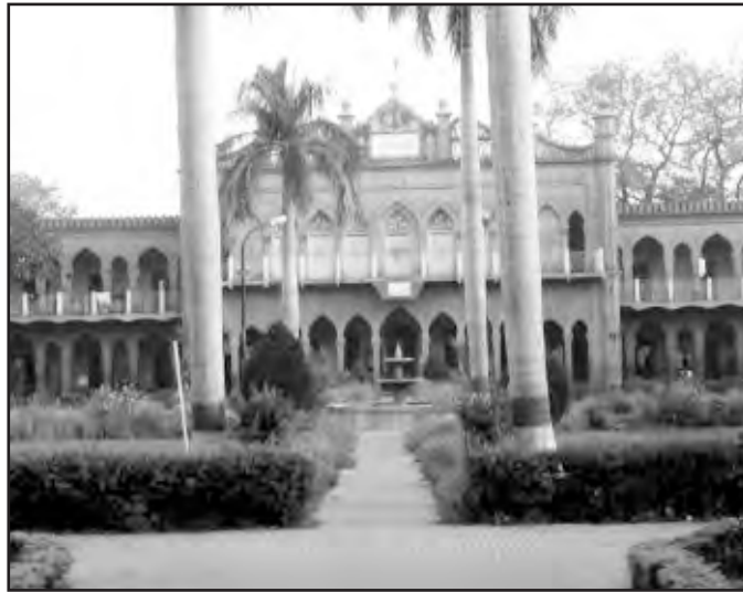
A scene of Aligarh Muslim University

college was upgraded to the standard of university in 1920.